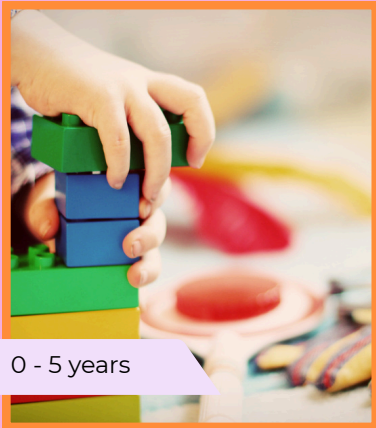
0 - 5 years