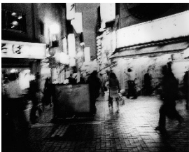
The Dark side of Light Black and white, Japanese photography.