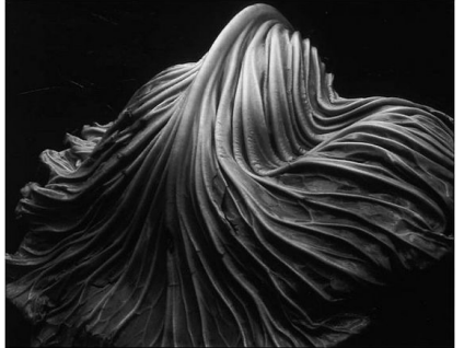
Linear Line and Tone. Drawing in photography.