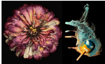
Melt and Decay Distorting shape and form