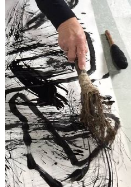
The Tools of Drawing The physicality of drawing.