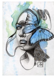
A Portrait of the Artist An artist inspired self portrait, piece by piece.