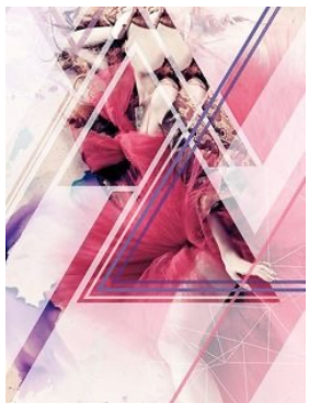
Geometric Flowers Observational flora and design.