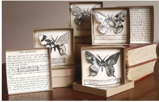
Art Shaped Box Assembled themes, skills and ideas.